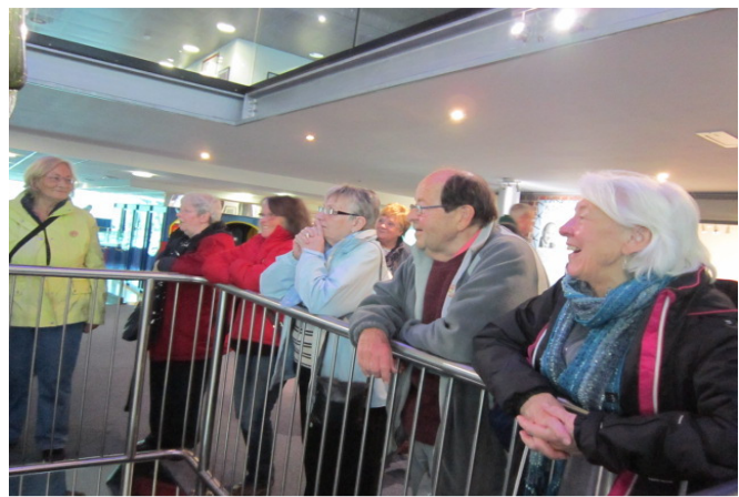
Members learning about the 2-ton chandelier

We had a splendid day at The World of Glass last Thursday and participated in many and varied fascinating activities. On arrival, we were greeted with tea or coffee and some delicious biscuits to fortify us for the day ahead. When we were suitably refreshed, we then watched a 20-minute film focusing on the history of glass through the centuries. The film informed us that glass was first